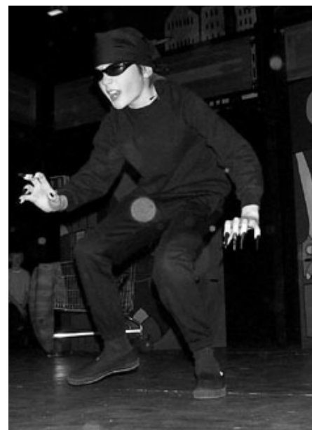
Mind the Rats! You don't want to miss The Pied Piper

Junior Theatre's fall production of The Pied Piper runs November 20-23 at WCC's College Theatre, located in WCC's Language Arts Building. Performances are Thursday, Friday, and Saturday evenings at 7:30, with matinees Saturday at 2pm and Sunday at noon and 3pm. This original update of the charming classic is directed by Anissa Morgensen-Lindsay and features a cast of over 30 area students. The Pied Piper is perfect for children ages four and up. Tickets are general admission, all seats are just $5, and are available at the door or by calling the office at 971-2228. ■