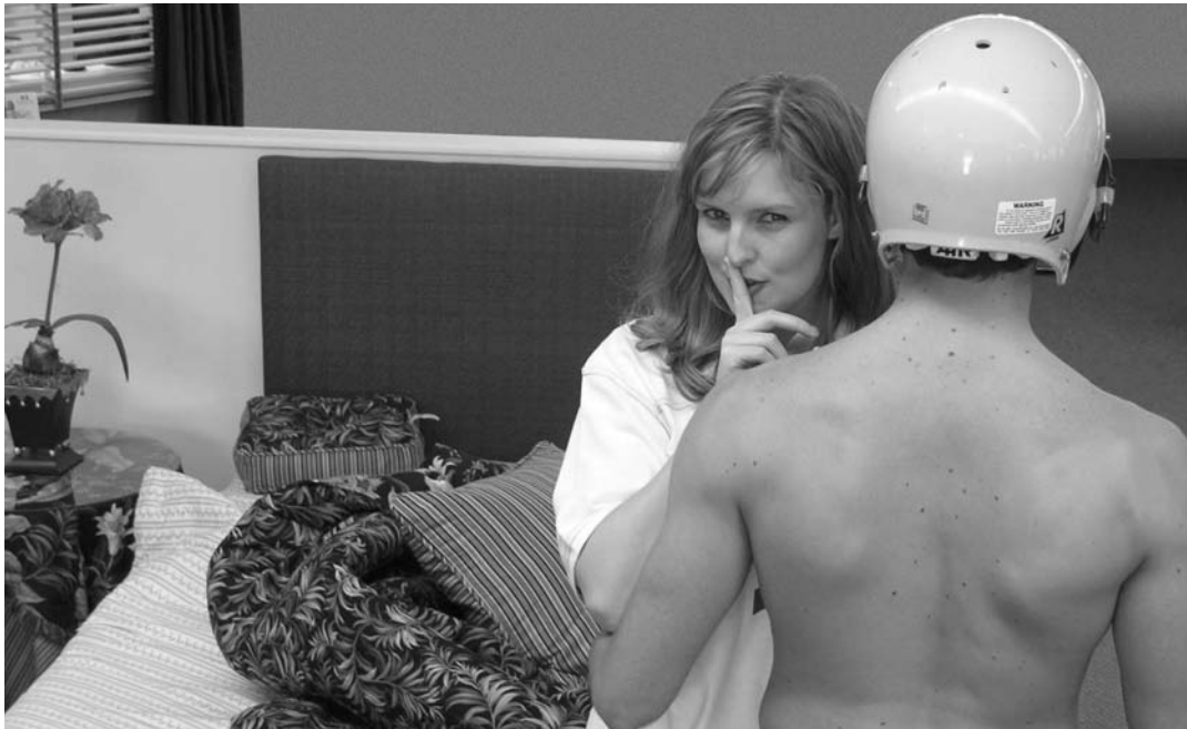
Get ready to explore the secrets of the Chicken Ranch by auditioning for The Best Little Whorehouse in Texas.